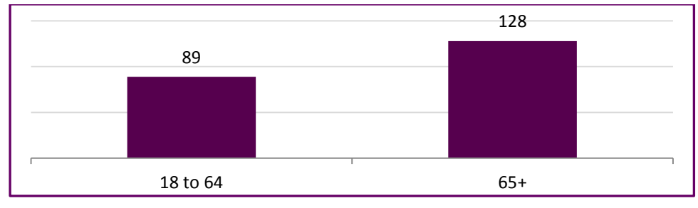
Chart Showing the Number People using Assistive Technology in 2016